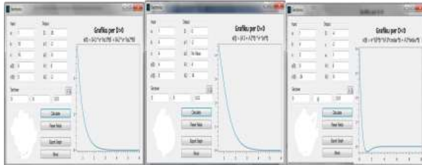
Figure 1. Plots of the solution of diff. eq. sec.-order. Over damped, critically damped, underdamped.