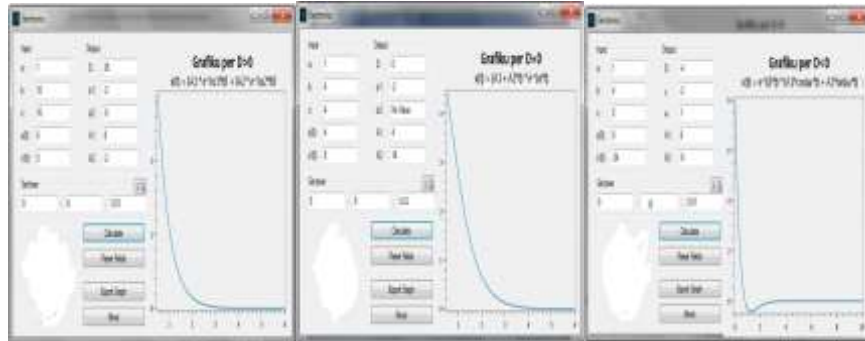
Figure 1. Plots of the solution of diff. eq. sec.-order. Over damped, critically damped, underdamped.