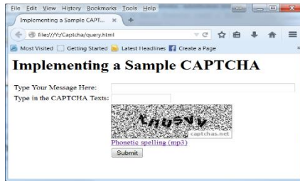
Fig 3. A simple Gimpy CAPTCHA coded with Python

website requests for a CAPTCHA, it sends a random string to the CAPTCHA server. The CAPTCHA server then calculates a password and returns the image in an encrypted format and the solution of the image to the user website