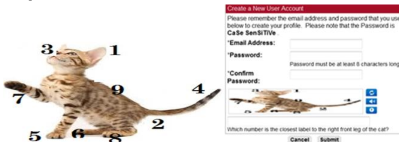
Fig. 4. Possible use of a Labeled-Image CAPTCHA. The figure on the left is the enlarged label-CAPTCHA on the web-form on the left.

Figure 4 shows sample use of a labeled-image CAPTCHA where the user will be asked, for instance: Which number is the closest label to the right front leg of the cat? As it is easy for human users to easily detect such a common organ of a cat and enter the number 7 regardless of their age, race, language and other distinctions they can easily solve such a Captcha problem.