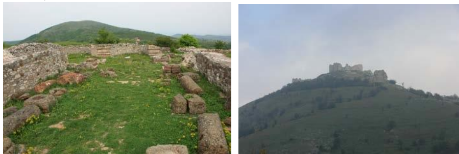
Fig. 7. Novo Bërdo: ruins of the Catholic Church and the fortress of this major medieval mining center of Balkans (author's photography in November 2014 and May 2015).

Since 2008, there exists the ICOMOS Charter on Cultural Routes: The new concept ... shows the evolution of ideas with respect to the vision of cultural properties, as well as the growing importance of values related to their setting and territorial scale, and reveals the macrostructure of heritage on different levels. This concept introduces a model for a new ethics of conservation that considers these values as a common heritage that goes beyond national borders, It also helps to illustrate the contemporary social conception of cultural heritage values as a resource for sustainable social and economic development. ... Cultural Routes represent interactive, dynamic, and evolving processes of human intercultural links that reflect the rich diversity of the contributions of different peoples to cultural heritage. [10] With its so-called Saxonian mining towns (Novo Bërdo, Trepça and others), medieval silver mining centers of European dimension, which enabled the living together of mining and trading experts from different nations, religions and cultures, Kosovo provides a nice example for that new concept within the world heritage community.