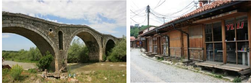
Fig. 6. Terzive (Tailors Guild) bridge on the way to and row of reconstructed wooden market stands within the market district of Gjakova.

Since 2008, there exists the ICOMOS Charter on Cultural Routes: The new concept ... shows the evolution of ideas with respect to the vision of cultural properties, as well as the growing importance of values related to their setting and territorial scale, and reveals the macrostructure of heritage on different levels. This concept introduces a model for a new ethics of conservation that considers these values as a common heritage that goes beyond national borders, It also helps to illustrate the contemporary social conception of cultural heritage values as a resource for sustainable social and economic development. ... Cultural Routes represent interactive, dynamic, and evolving processes of human intercultural links that reflect the rich diversity of the contributions of different peoples to cultural heritage. [10] With its so-called Saxonian mining towns (Novo Bërdo, Trepça and others), medieval silver mining centers of European dimension, which enabled the living together of mining and trading experts from different nations, religions and cultures, Kosovo provides a nice example for that new concept within the world heritage community.