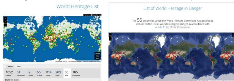
Fig. 1. The World Heritage List of UNESCO, left, and List of World Heritage in Danger with Medieval Monuments in Kosovo, right

In 1992, UNESCO established the WHC to act as the Secretariat and coordinator within UNESCO for all matters related to the Convention. The Centre is located in Paris and for the moment directed by the German Mechtild Rössler. The World Heritage Committee within UNESCO is the executive committee to decide annually about the listing of cultural and natural sites in the World Heritage List. If the condition of a particular world heritage is no longer according to its criteria, UNESCO deletes the monument, site or cultural landscape from its World Heritage List after various warnings from the WHC (“Heritage Alert”). The most prominent case within Europe is Dresden Elbe Valley, which fell from the list due to the building of a four-lane bridge (“Waldschlösschenbrücke”) in the heart of the cultural landscape in 2009. Nearly the same happened in Cologne when a spectacular museums’ project in the neighborhood of the dome won the international architectural competition. In that case, the city authorities chose to modify the architectural project under the guidelines of the ICOMOS expertise and so Cologne did not lose its status as world heritage site.