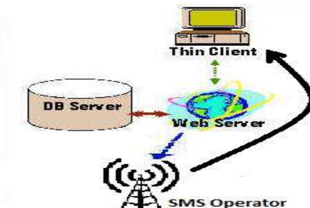
Fig 3. The authentication process

Server should be implemented in such a way as to be able to generate a 5 digit number, to be able to send these codes to users of system via SMS, make the validation of the parameters received from the client, check number of attempts to login with a code that was generated once, check the expiry time on which a code is valid for authentication after generation, and to assess whether it can proceed with authentication if the parameters are properly given.