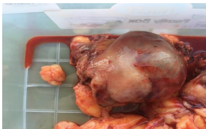
Figure 2. Completely removed tumor.