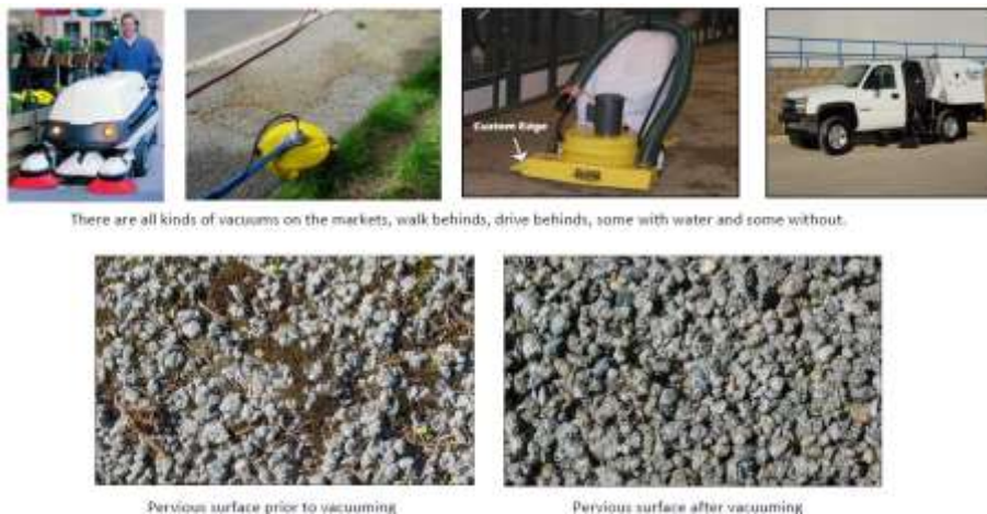
Fig. 9. Maintenance in the life service.

The two commonly accepted maintenance methods are pressure washing and power vacuuming. Pressure washing forces the contaminants down through the pavement surface. This is effective, but care should be taken not to use too much pressure, as this will damage the pervious concrete. Power vacuuming removes contaminants by extracting them from the pavement voids. The most effective scheme, however, is to combine the two techniques and power vacuum after pressure washing. [1], [10]. [14].