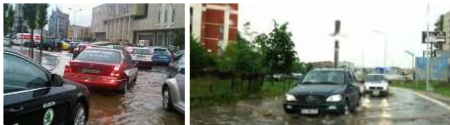
a) Tirana after rainfall

In three last decades in Tirana, respectively two in Prishtina we are facing a rapid urban development. Random constructions, without detailed urban design of multi stories buildings has resulted with a chaotic urban and architectural state. Many times we witness events of water-runoffs and storms on our streets and other areas built with conventional materials: asphalt, normal concrete, paving blocks, etc. during rainfalls. This needs to cope with. In mitigating this, the Pervious Concrete is, if not the only, is the best solution.