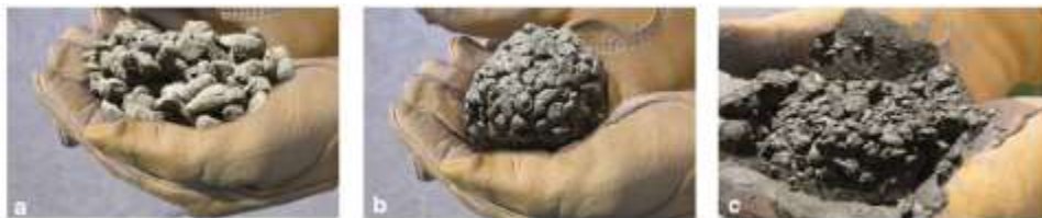
Fig. 5. Samples of pervious concrete with different water contents formed into a ball:

** Laboratory mixtures with flow rates as high as 700 L/m 2 /min have been prepared.