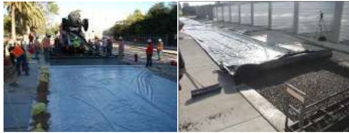
Fig.8. Plastic sheeting should be used to cover the pervious concrete to prevent moisture loss. (R. Banka)