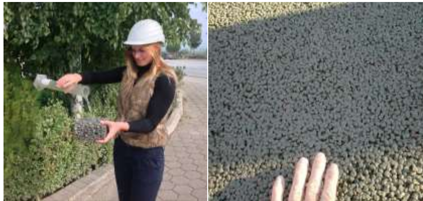
a), PC, aggregate used 2/16 mm

Aggregate grading used in pervious concrete are typically either single-sized coarse aggregate or grading between 2/4, 4/8 and 8/16 mm. (2/4, 4/8 and 8/11.2 mm), i.e. no fines.