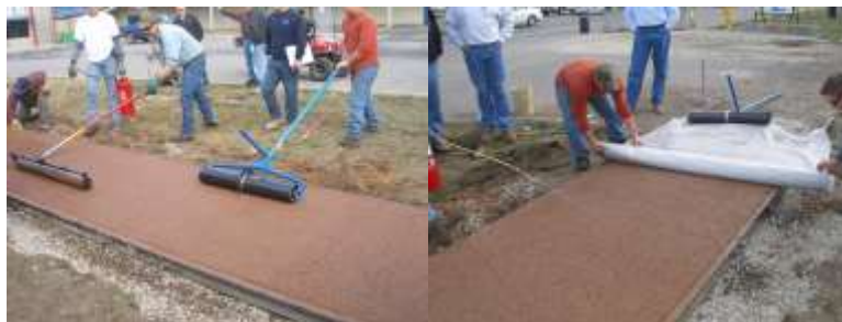
Fig. 7. Joint roller, commonly referred to as a “pizza cutter” and curing (R. Banka)

Finishing. Pervious concrete pavements are not finished in the same manner as conventional pavements. In essence, the final surface finish is achieved as part of the consolidation process, which leaves an open surface. Normal concrete finishing procedures, such as with bull floats and trowels, should not be performed. [6],[10].