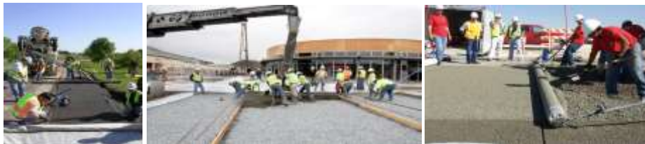
Fig. 6. Placing, roller screeding fresh Pervious Concrete

After depositing the concrete, quickly bring it to the correct elevation with a rake or other hand straight edge tool. Vibratory screeds are acceptable and encouraged. Caution should be taken to minimize pulling or shoveling the concrete into position, filling the voids or walking on the pervious concrete [10].