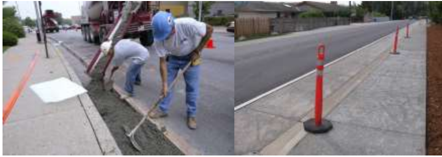
Fig. 2. Application of Pervious Concrete in construction of sidewalks and culvert.