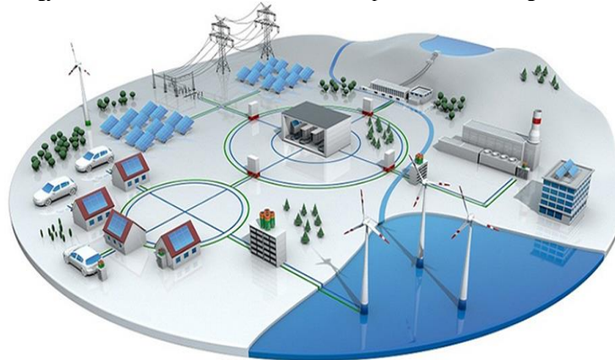
Fig. 2 Smart grid (acatech, 2013).

The remaining energy could be stored in the net. An example is shown in Fig.2