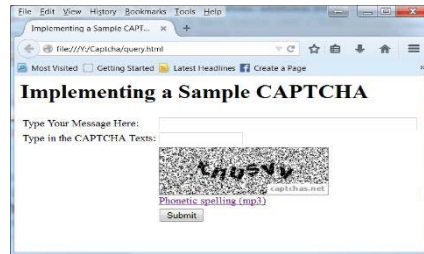
Fig 3. A simple Gimpy CAPTCHA coded with Python